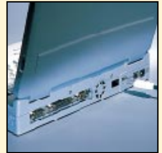
Everything at your fingertips. All the connectivity you need – from standard serial ports to USB – is built into the back of your notebook.