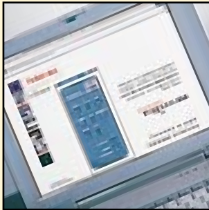
All's clear: whether it's the DSTN or TFT version, the 12.1" colour screen will always keep you in the picture.