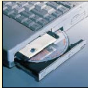
Everything's inside: both the diskette drive and CD-ROM drive come built in, thanks to our new "simply complete" concept.