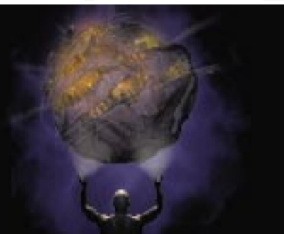
3d Studio MAX