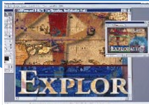
Adobe: Photoshop 4.0

The criteria for your next workstation can be nothing less than potent performance, faultless reliability and worry-free application compatibility—the very standards the IBM IntelliStation meets through certification by leading software vendors. Their rigorous testing confirms the IBM IntelliStation's performance and compatibility, as well as giving you the assurance of expert, coordinated support, encompassing both hardware and software issues. For the real-world demands you face every day, IBM has the experience, resources and technology partnerships to lay it on the line: the IBM IntelliStation is where your vision will shine. For the current list of supported applications, visit our Web site at www.ibm.com/pc/us/intellistation